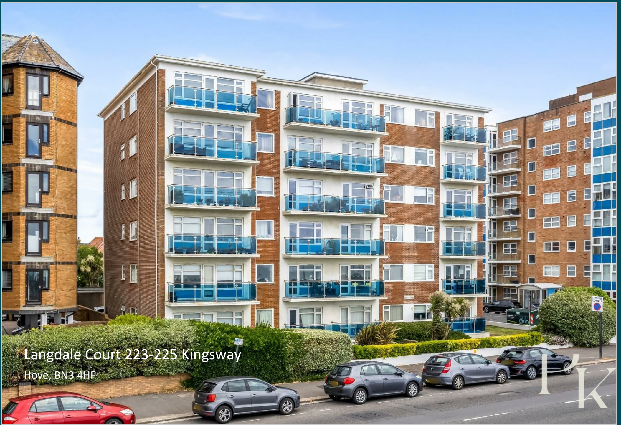
Langdale Court 223-225 Kingsway Hove, BN3 4HF